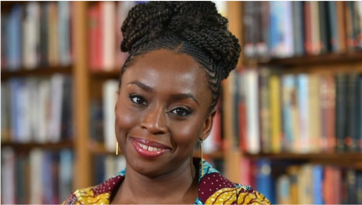
Chimamanda Ngozi Adichie

Americanah has won the National Book Critics Circle Award and many other prizes, including being listed in the New York Times' Ten Best Books of 2013.