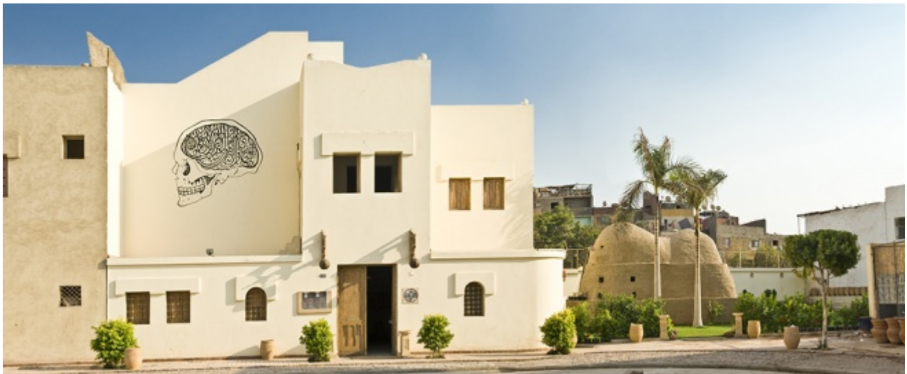
Darb 1718 Contemporary Art and Culture Center in Cairo

The scope and breadth of art programming in education in Egypt is miniscule. Contemporary art and critical writing are largely absent from the curricula of higher education. It is therefore not surprising that the artists of the Egyptian avant-garde, for example, have played a non-existent role in informing today's young art students. It wasn't until 2015 that an important conference on the Egyptian Surrealist movement presented a significant survey, for the first time, on a local art movement that would have otherwise been forgotten [3] . Many young artists in Egypt today rely quite heavily on the independent cultural institutions that provide workshops, lectures, screenings and spaces for exhibiting art. A new art discourse is taking form, a critical rhetoric, a reflective practice and, for the most part, it is not happening in our universities.