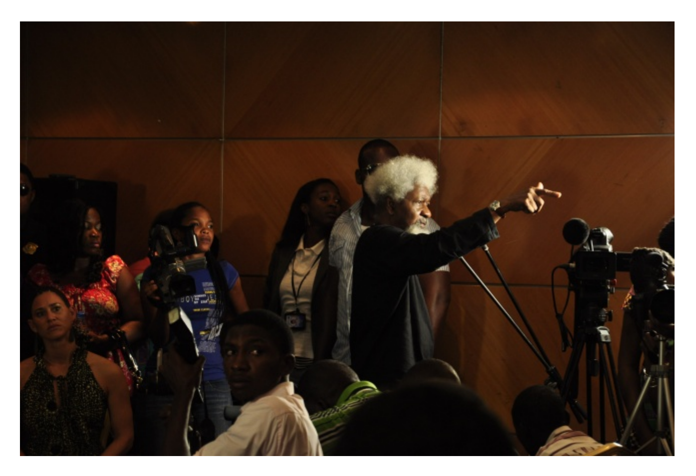
Wole Soyinka

Africa-concept or reality-is an acknowledged continent of extremes, and, by the same token, it is hardly surprising that it draws extreme reactions. Africans themselves are just as divided in their responses or strategies of accommodation-acquiescing, protective, resigned or fiercely defensive, identifying with, justifying or dissociating themselves from what is apparent or presumed to lie beneath the surface. The increasingly accepted common ground, both for the negativists and optimists, is that the African continent does not exist in isolation, not has it stood still in a time warp, independent of history. On the contrary, the continent is an intimate part of the histories of others, both cause and consequence, a complex organism formed of its own internal pulsation and external interventions, one that continues to be part of, yet is often denied, the triumphs and advances of the rest of the world.