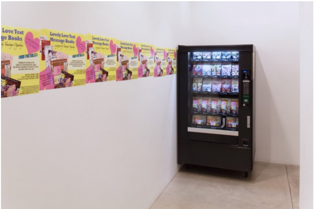
Temitayo Ogunbiyi, Lovely Love Text Message Books, 2013

Ogunbiyi operates a multi-dimensional practice that often manifests itself through site-specific mixed media works. Her practice employs drawing, fabric work and collage in order to reflect upon her interest in, “in contemporary channels of communication, and how such interactions take place in public or virtual space.” Hence, “interactions with particular communities,” allow her to reference, “human habits, forms of growth and repeated gesture,” and her active participation in the exhibition installation is reflective of these performances.