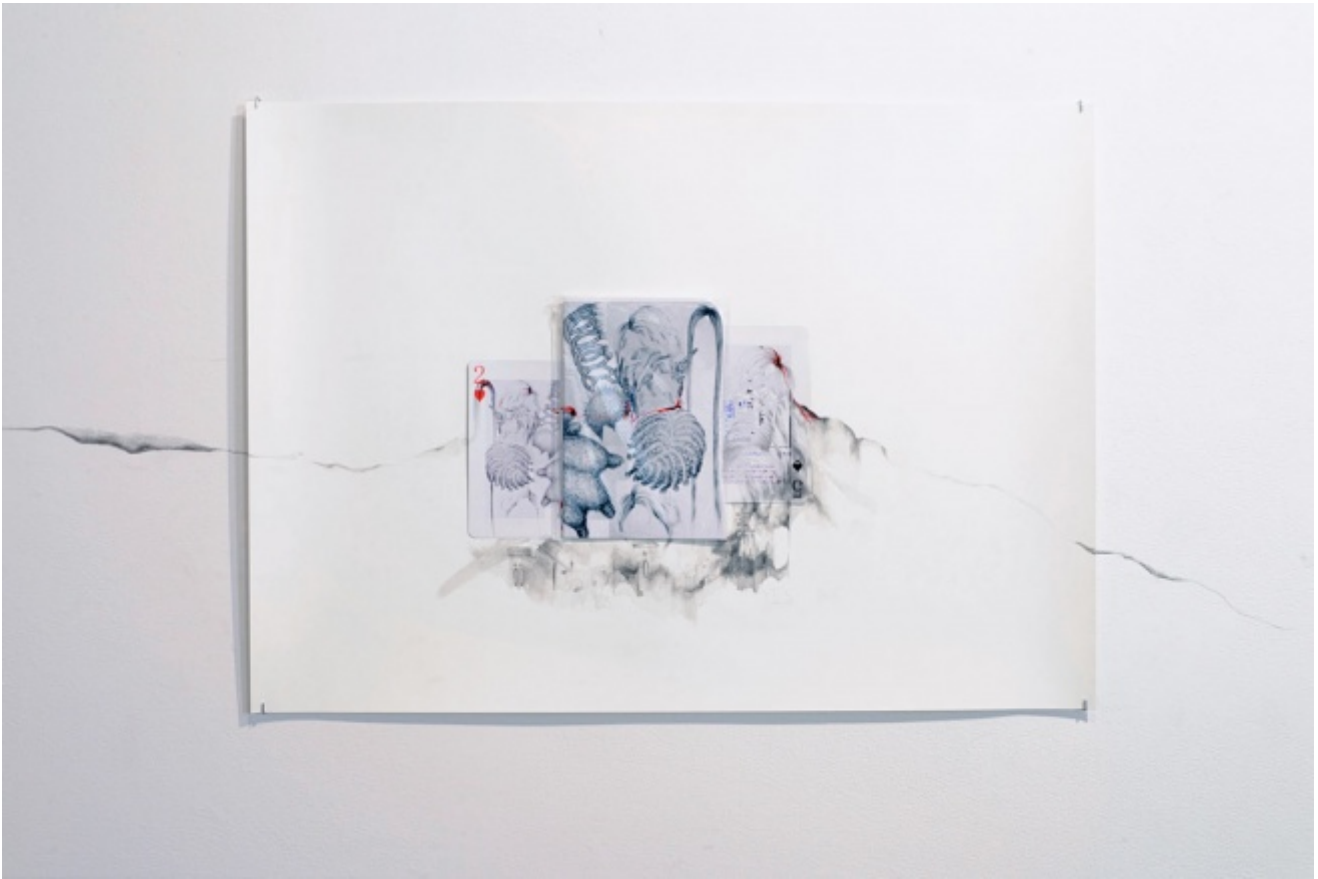
Temitayo Ogunbiyi, Untitled, 2013

Now living and working between Lagos, Nigeria and Yallahs, Jamaica, Ogunbiyi holds degrees from Columbia and Princeton universities in the USA and notable exhibitions include Six Draughtsmen , Museum of Contemporary Diasporan Art Lagos, Nigeria (2013); The Progress of Love , The Pulitzer Art Foundation, St. Louis, USA; Center for Contemporary Art Lagos Keunstlerhaus, Bethanien, Berlin (2012); All We Ever Wanted , Centre for Contemporary Art, Lagos (2011) and New "Paintings," Boardroom, S&S Hotels and Suites, Lagos (2011).