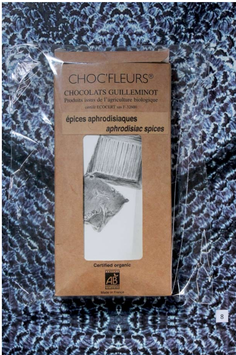
Temitayo Ogunbiyi, Elevator (Abeokuta to Dakar) detail , 2014