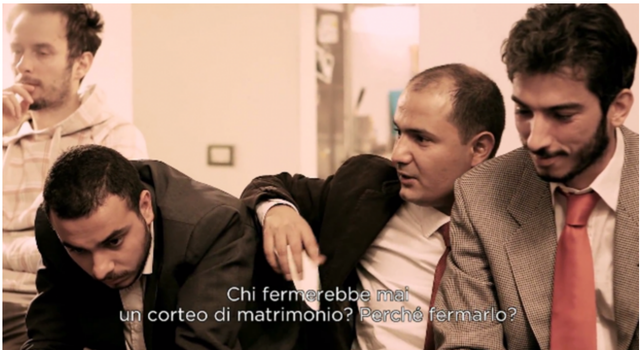
Io sto con la sposa (2014) , screenshot dal film.

turned into an educational kit for schools.