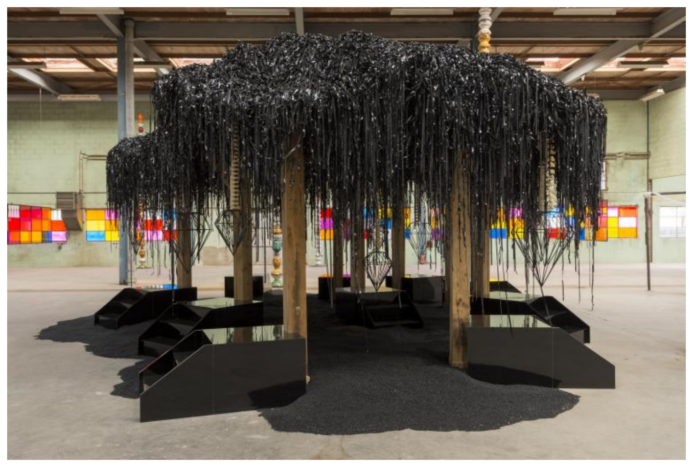
Pascale Marthine Tayou, Diamondscape, 2012. Wood, formica shiny metal structures, chains, resin, motors, cables, telephone wires and magnetic stripe. Variable dimensions. Exhibition view Voodoo Child - Galleria Continua / Les Moulins, April 2017 Courtesy the artist and GALLERIA CONTINUA, San Gimignano / Beijing / Les Moulins / Habana. Photo by Oak Taylor-Smith

The white man, just as the black man, are here just the metaphors that represent the dominators and the dominated .