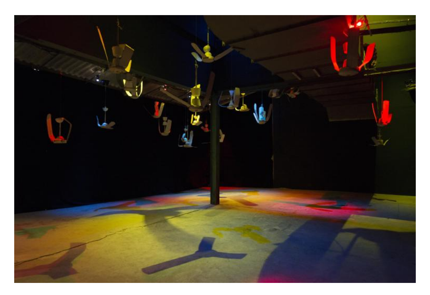
Pascale Marthine Tayou, La danse des ventilateurs, le vent..., 2012. Ventilateurs, motors. Variable dimensions. Exhibition view Voodoo Child - Galleria Continua / Les Moulins, April 2017. Courtesy the artist and GALLERIA CONTINUA, San Gimignano / Beijing / Les Moulins / Habana. Photo by Oak Taylor-Smith

Bonaventure Ndikung...) have arrived and helped to reveal the contemporary language of the Africans to the world stuck in its ethnocentric definitions. The market follows and does nothing but follow.