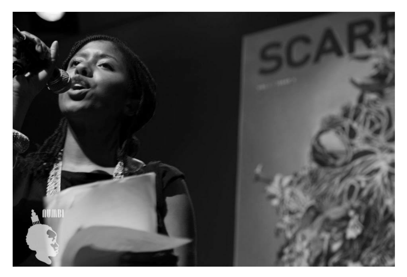
Numbis Scarf magazine launch @ Rich Mix.

Three decades have passed since then, but the sweet harmony, complicity and cheerfulness that accompanied our little adventures and marked our coming of age are still alive.