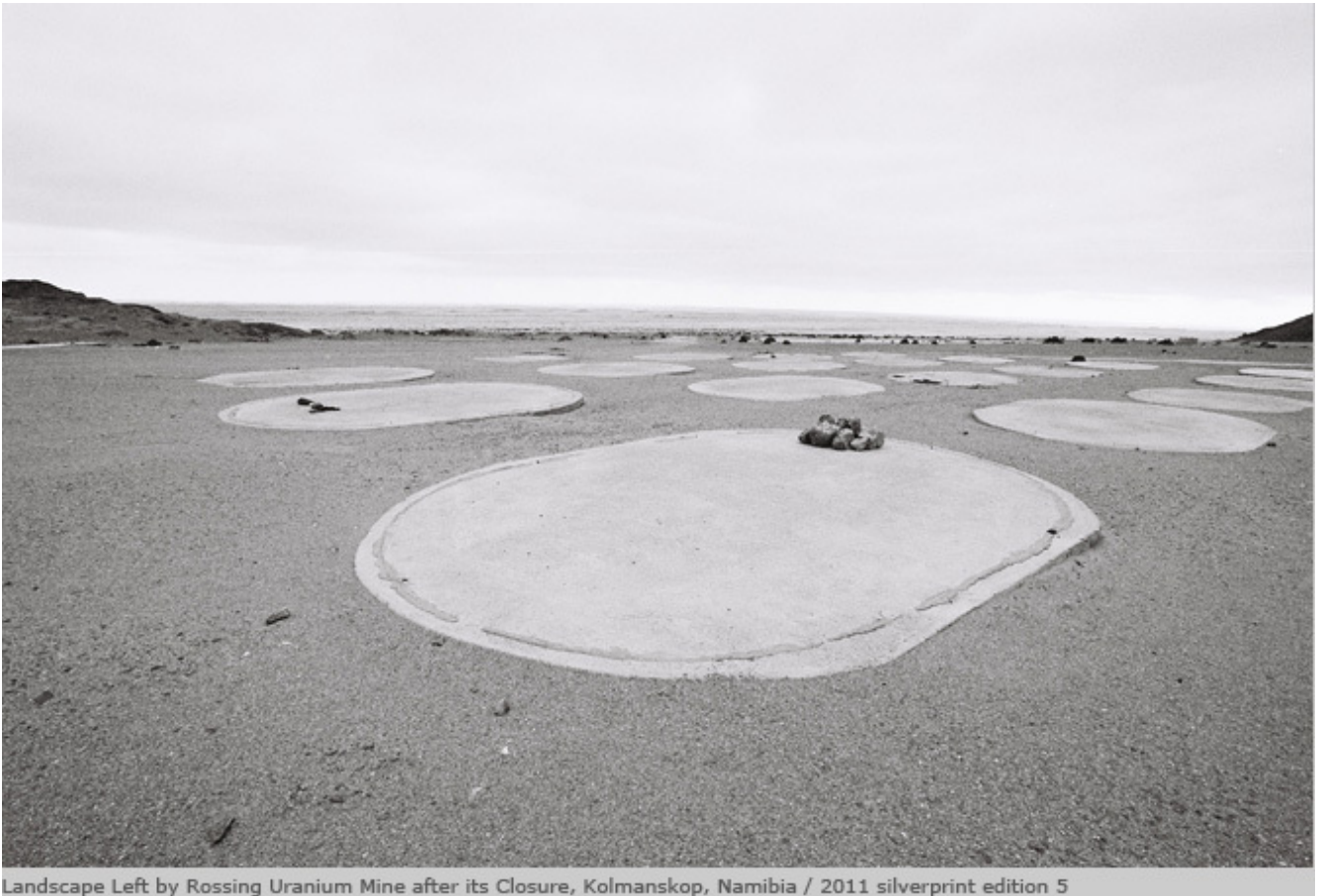
Landscape Left by Rossing Uranium Mine after its Closure, Kolmanskop, Namibia / 2011 silverprint edition 5

Drawing on Georges Didi-Huberman, Mofokeng's photographs could be described as "figuring figures." The automatism of the camera irremediably breaks with the idea of a "figured figure" (whereby nature is observed, imitated, and the result is a nice picture), replacing it with that of multiplicity. The image is therefore conceived as potency, as a potential part of a series, so the focus is not on the relation between a single image and the represented reality, but on the relation of each picture to the others, on the sequence. In this way, images overlap and refer to each other, thus enhancing their meaning and freeing themselves from the mere realism of representation.