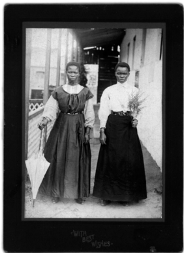
Slide 8/80 / 1997 black and white slide projection, installation edition 5