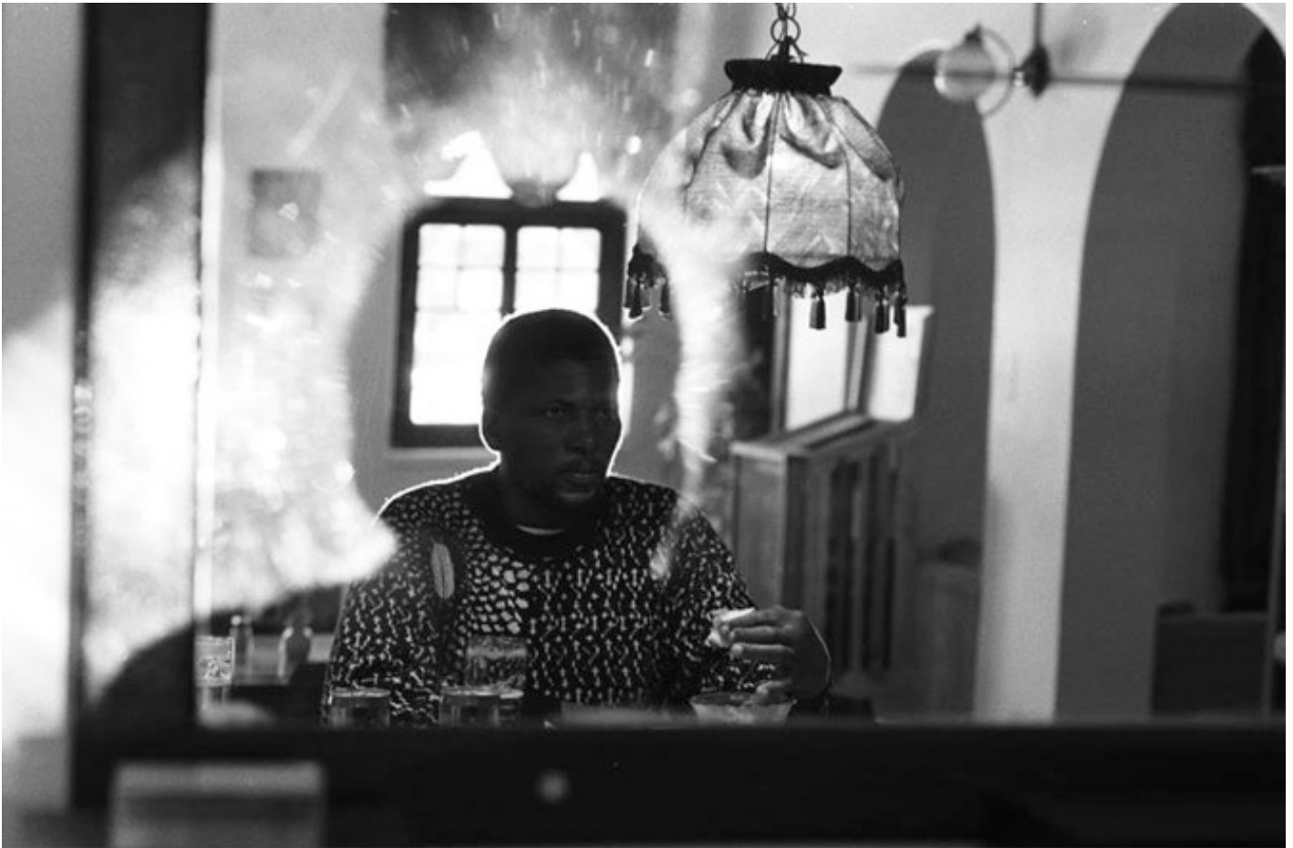
Moth'osele Maine, Bloemhof / 1994 silverprint edition 5

It is within this framework that Mofokeng's visual journeys are inscribed, along with his attempts to give substance to South African landscapes of violence and tragedy. Here, the concept of seriti-shadow suggests a form of "remembrance," namely – as Mofokeng states – a process through which forgotten memories come back to life. The body is the landscape on which the most relevant stories and myths in the construction of national identity are inscribed. In Vlakplaas (the infamous Apartheid detention and execution centre), the natural landscape is only ruined by the presence of a wire fence, a sign of the prison area as well as a metaphorical scar in the memory of the country; in a similar way, in the Robben Island triptych, only the corners of the wall separating the detention space from the outside world are visible.