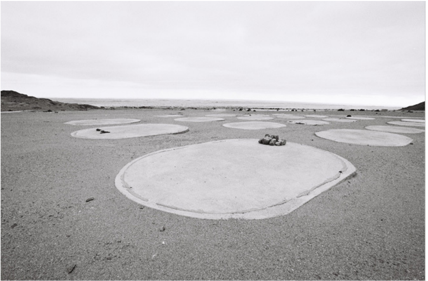
Landscape Left by Rossing Uranium Mine after its Closure, Kolmanskop, Namibia / 2011 silverprint edition 5

Drawing on Georges Didi-Huberman, Mofokeng's photographs could be described as "figuring figures." The automatism of the camera irremediably breaks with the idea of a "figured figure" (whereby nature is observed, imitated, and the result is a nice picture), replacing it with that of multiplicity. The image is therefore conceived as potency, as a potential part of a series, so the focus is not on the relation between a single image and the represented reality, but on the relation of each picture to the others, on the sequence. In this way, images overlap and refer to each other, thus enhancing their meaning and freeing themselves from the mere realism of representation.