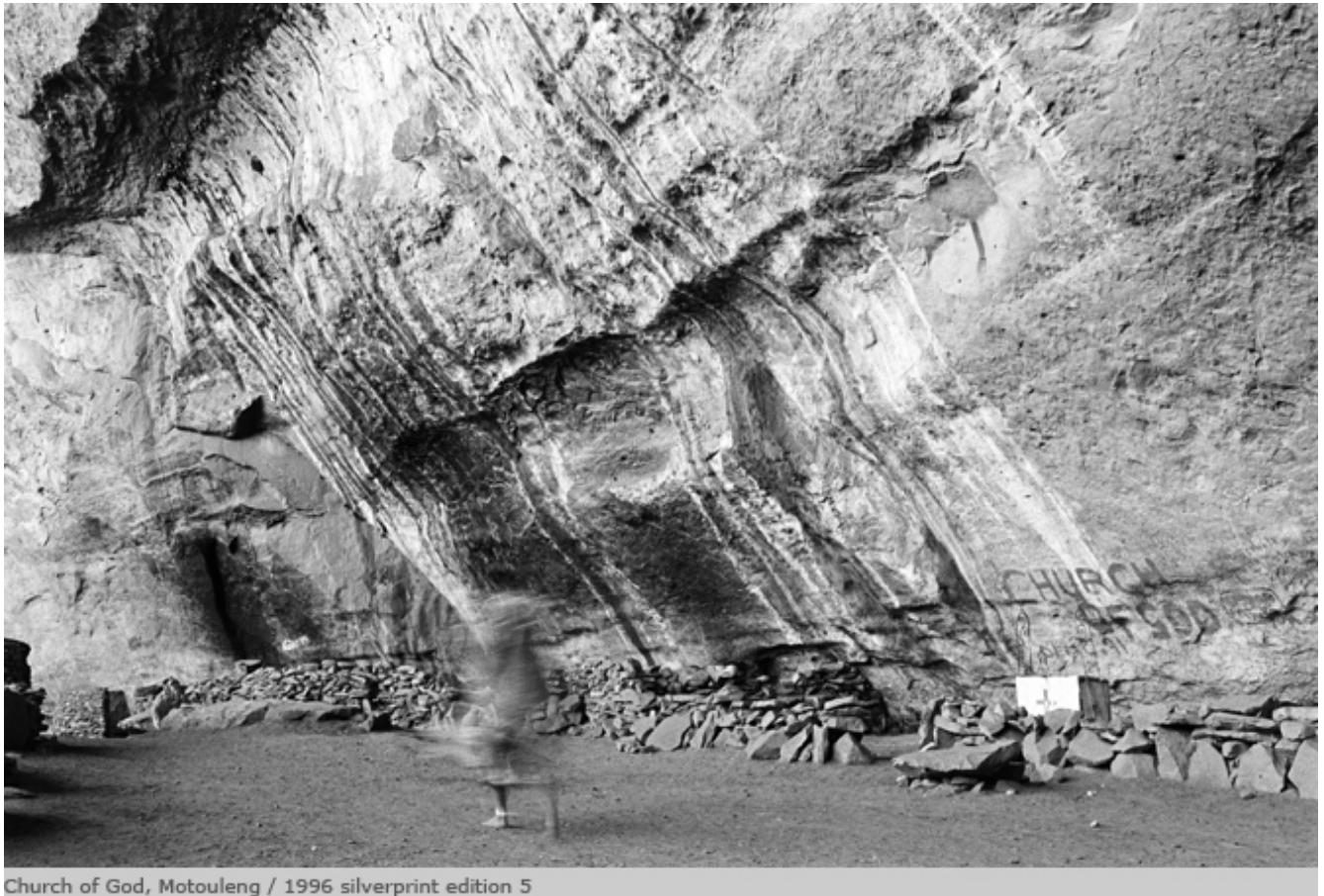
Church of God, Motouleng / 1996 silverprint edition 5

As Mofokeng points out, in South Africa, unlike in the European tradition, “shadow” indicates something real. Seriti – the word for “shadow” in sesotho , his mother tongue – does not just refer to the absence of light, but can mean anything from aura, presence, confidence, or dignity, also referring to the power to attract good luck and ward off evil forces and illness. This is evident in Rumours/The Bloemhof Portfolio (1988–1994), where the voices evoked by Mofokeng are translated into a photographic language. Bloemhof is a small town of the Transvaal region in South Africa, where Mofokeng documented the lives of tenant farmers, often referred to as “yokels”, and observed people’s excitement and fear on the eve of the first democratic elections in 1994, as emblematically shown in Moth’osele Mainie . Here, a light seems to emerge from the shadow of the subject, overlapping his image and brightening the room, but it might as well be the photographer’s or the viewer’s reflection, a trace of their own gazes and expectations.