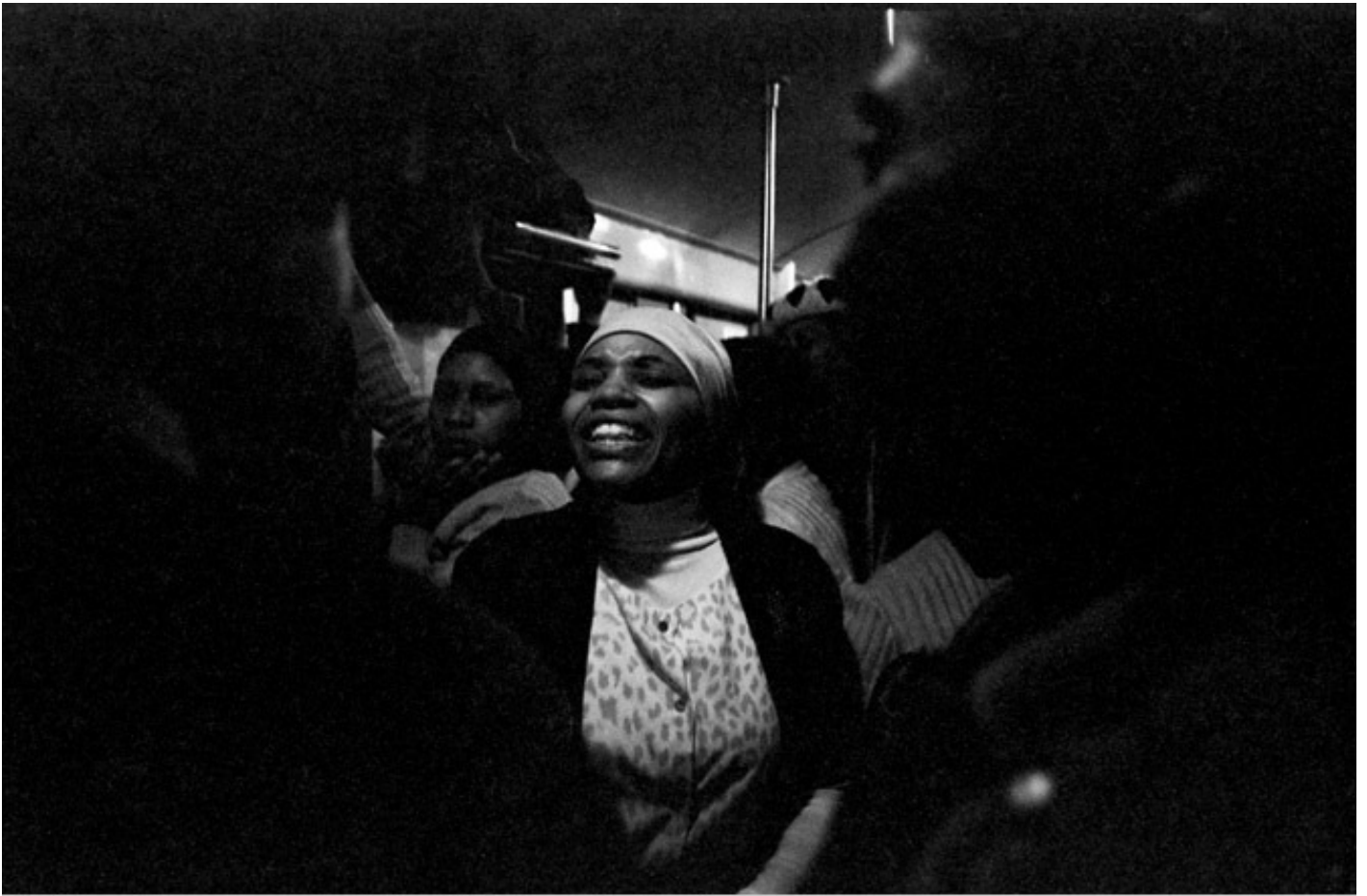
Exhortations, Johannesburg - Soweto Line / 1986 silverprint edition 5

In Chasing Shadows (1996-2004), Mofokeng deals with the issue of spirituality from another perspective. Spanning nearly a decade, these pictures were taken in the caves of Motouleng, Manspopa and various pilgrimage sites in the Free State province of South Africa, worshipped as holy places by both Christian communities and the followers of other ancestral religions. The “shadows” are souls, entities, spirits, and energies that are part of the world. They evoke something that is both imaginary and real, blurring the line between sacred and profane, human and divine. In Church of God , the sacredness of the place becomes one with the “aura” of the individual, their invisible forces leaving tangible traces in the world.