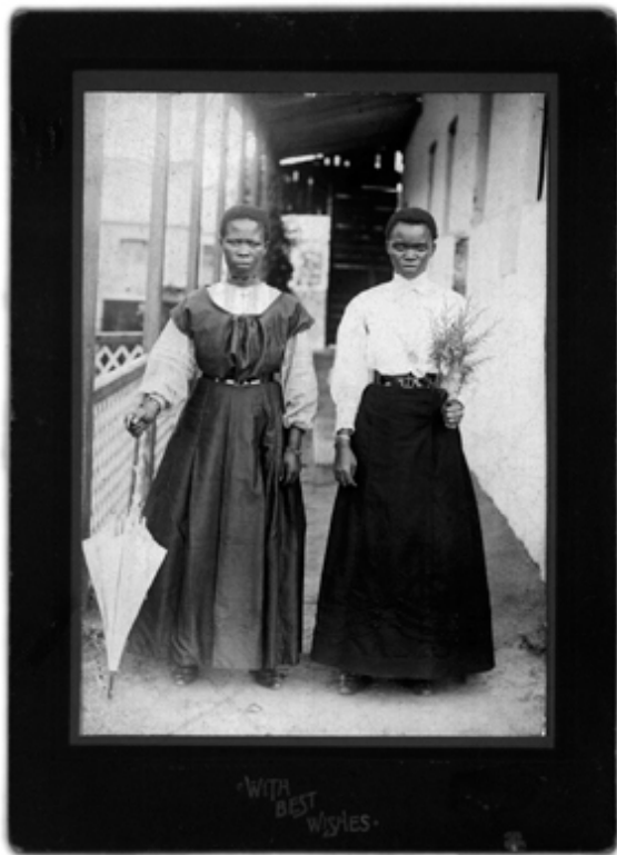
Slide 8/80 / 1997 black and white slide projection, installation edition 5

Mofokeng, entitled Township Billboards (1991-2004).