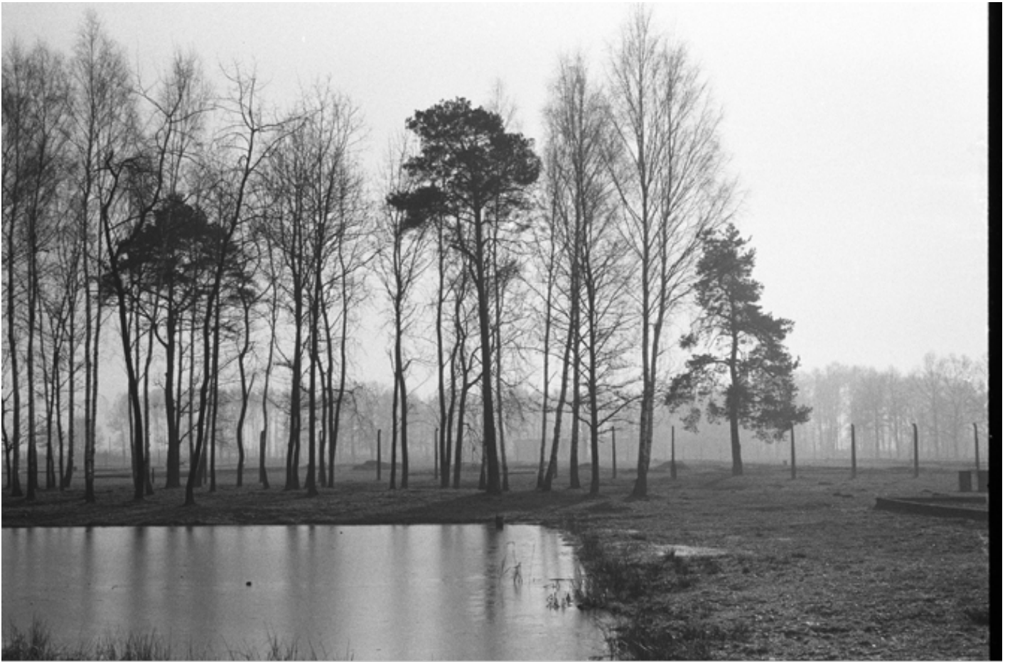
Lake Once Filled With The Ashes of tThe Cremated, KZ2-Auschwitz / 1997 silverprint edition 5

The same goes with the Poisoned Landscapes (2010-2011) and Climate Change (2007) series, which include pictures of disused mines and toxic waste sites, documenting the effects of climate change. Here, Mofokeng brings out what the viewer cannot easily glimpse, enhancing the ambiguity of the images and juxtaposing desolation and beauty, such as in Landscape Left by Rössing Uranium Mine , an ideal response to the Trauma Landscapes .