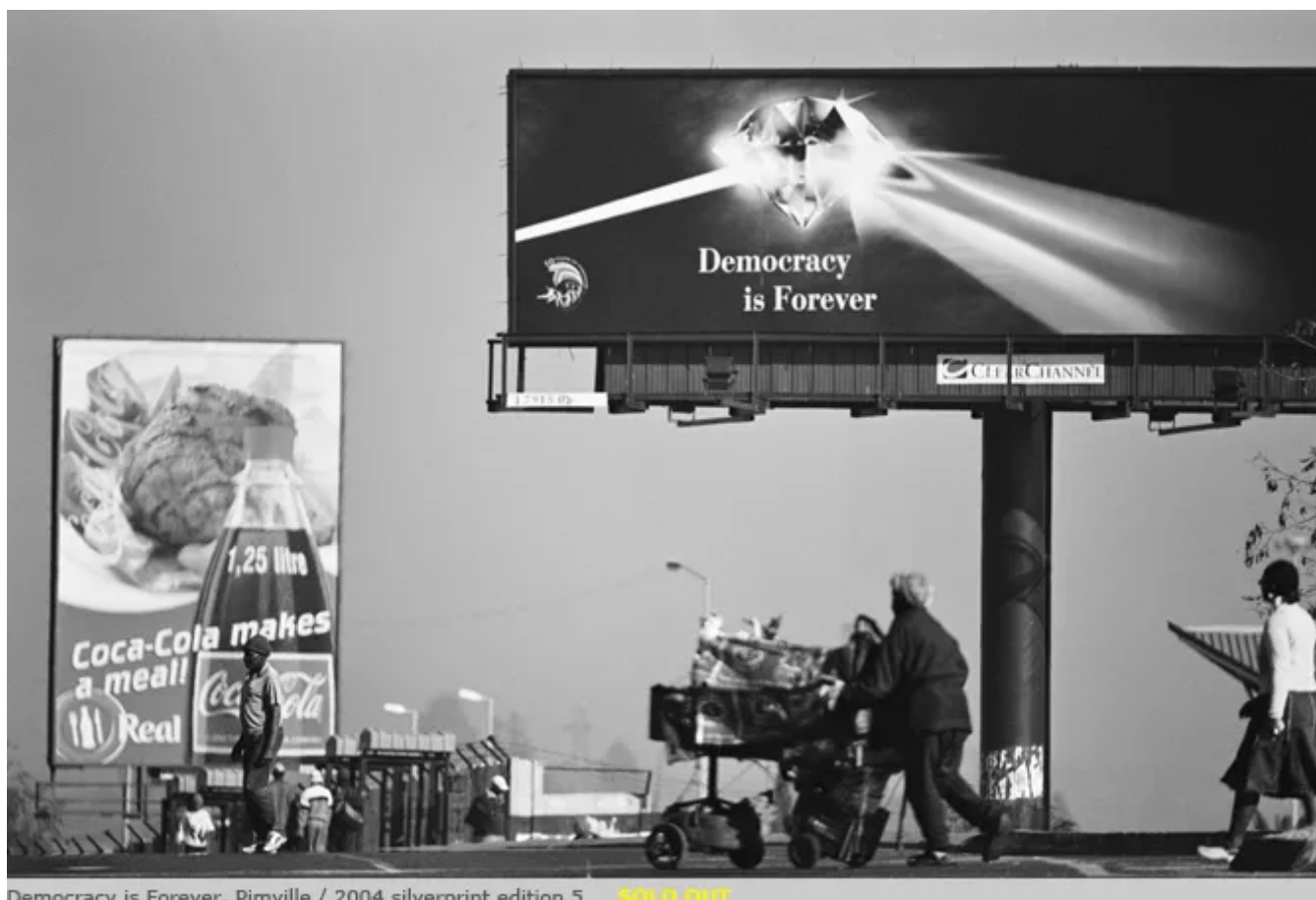
Democracy is Forever, Pimville / 2004 silverprint edition 5 SOLD OUT

Se continuiamo a tenere vivo questo spazio è grazie a te. Anche un solo euro per noi significa molto. Torna presto a leggerci e SOSTIENI DOPPIOZERO