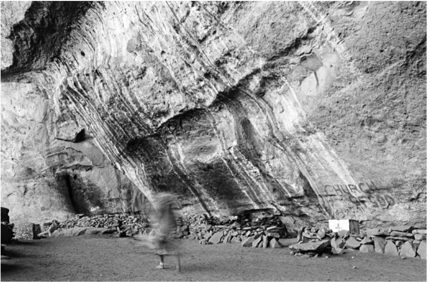
Church of God, Motouleng / 1996 silverprint edition 5

As Mofokeng points out, in South Africa, unlike in the European tradition, “shadow” indicates something real. Seriti – the word for “shadow” in sesotho , his mother tongue – does not just refer to the absence of light, but can mean anything from aura, presence, confidence, or dignity, also referring to the power to attract good luck and ward off evil forces and illness. This is evident in Rumours/The Bloemhof Portfolio (1988–1994), where the voices evoked by Mofokeng are translated into a photographic language. Bloemhof is a small town of the Transvaal region in South Africa, where Mofokeng documented the lives of tenant farmers, often referred to as “yokels”, and observed people’s excitement and fear on the eve of the first democratic elections in 1994, as emblematically shown in Moth’osele Maine . Here, a light seems to emerge from the shadow of the subject, overlapping his image and brightening the room, but it might as well be the photographer’s or the viewer’s reflection, a trace of their own gazes and expectations.